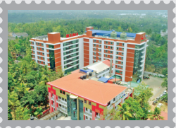
KIMSHEALTH Hospital Kollam