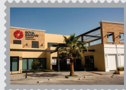
ROYAL BAHRAIN Hospital Medical Center