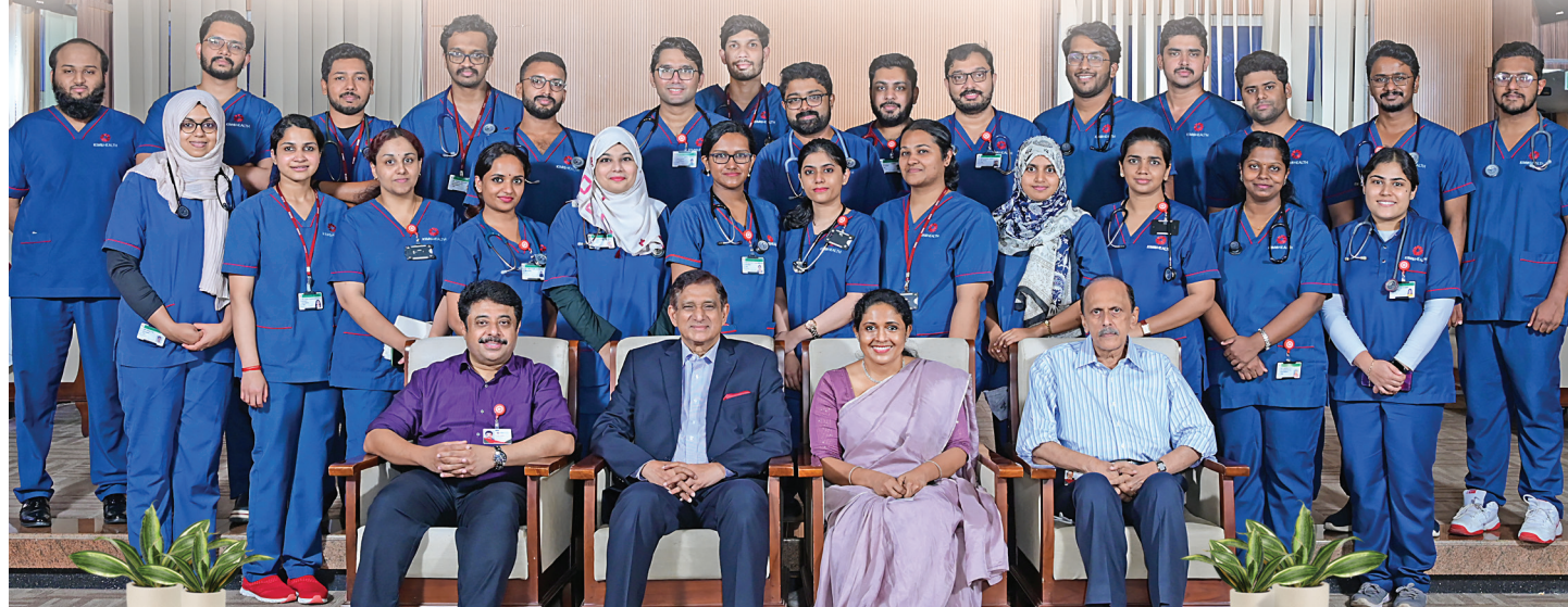
IMT Trainees with the Steering Committee