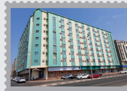
KIMSHEALTH Medical Center Jubail