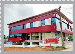
KIMSHEALTH Medical Center Attingal