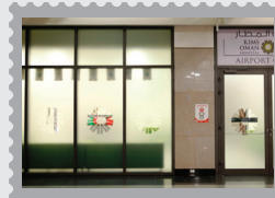
KIMSHEALTH Airport Clinic Muscat