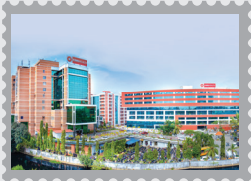
KIMSHEALTH Trivandrum & KIMSHEALTH Cancer Center