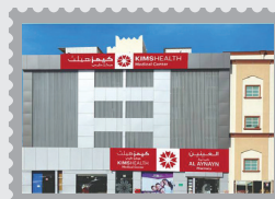
KIMSHEALTH Medical Center Wakra