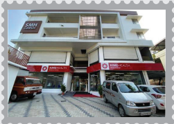
KIMSHEALTH Medical Center Manacaud