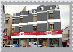
KIMSHEALTH Medical Center Um Al Hassam