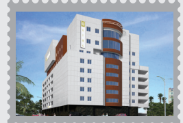
KIMSHEALTH Hospital Umm Al Hassam