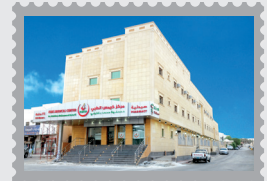
KIMSHEALTH Medical Center Riyadh