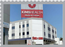
KIMSHEALTH Medical Center Muharraq