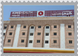
KIMSHEALTH Oman Hospital