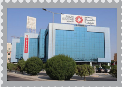
ROYAL BAHRAIN Hospital