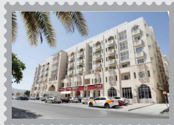
KIMSHEALTH Medical Center Al Khuwair