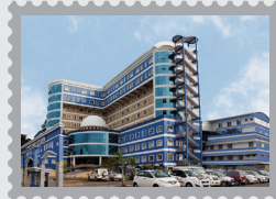
KIMS Al Shifa, Perinthalmanna