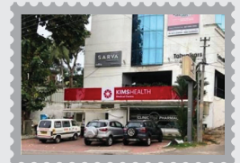
KIMSHEALTH Medical Center Kuravankonam, Trivandrum