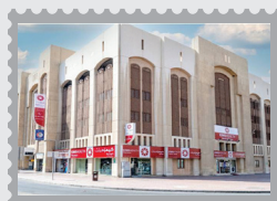
KIMSHEALTH Medical Center Bur Dubai