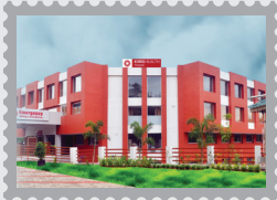
KIMSHEALTH Hospital Kottayam