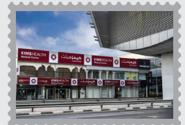
KIMSHEALTH Medical Center Deira