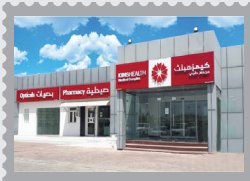
KIMSHEALTH Medical Complex Duqm