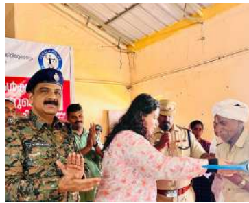
Shri. VU. Kuriakose IPS Idukki district police chief