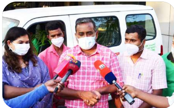
Tree Ambulance Flag off by P. Prasad - Minister of Agriculture