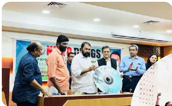
Shri. V. Sivankutty, Minister for general education & Labour