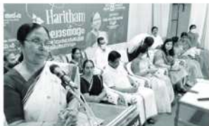
മട്ടന്നൂർ ഹൈസ്കൂൾ മാധ്യമവിഭാഗത്തിൽ നടന്ന ഹരിത പരിപാടിയിൽ പങ്കെടുത്തവർ.

മട്ടന്നൂർ നിയോജക മണ്ഡലം അതിന്റെ സുപ്രസിദ്ധതയ്ക്ക് ഉദാഹരണമായി സൂക്ഷ്മകർമ്മ പ്ലാന്റ് വിതരണത്തിനും വിതരണം ചെയ്യും.