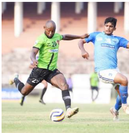
2023 Kerala premier league matches Super six round against Gokulam FC