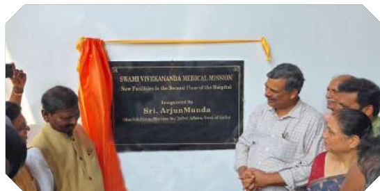
Central minister for Tribal affairs Shri. Arjun Munda & Tamilnadu, Coimbatore, MLA, Smt. Vanathi Srinivasan