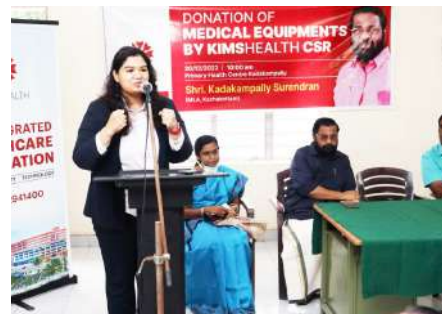
Kazhakoottam MLA Shri. Kadakampally Surendran inaugurated the programme.