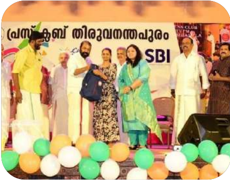
Shri. V. Sivankutty Minister for general education & Labour