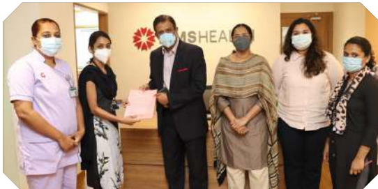
Training to Nurses from SVMM Hospital Attappadi