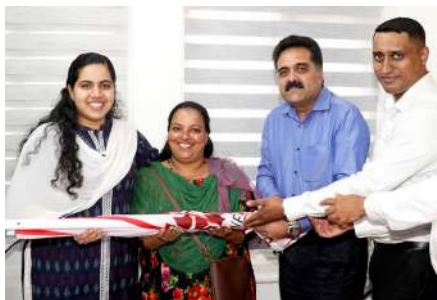
Umbrella handed over by Hon. Thiruvananthapuram Corporation Mayor Smt. Arya Rajendran