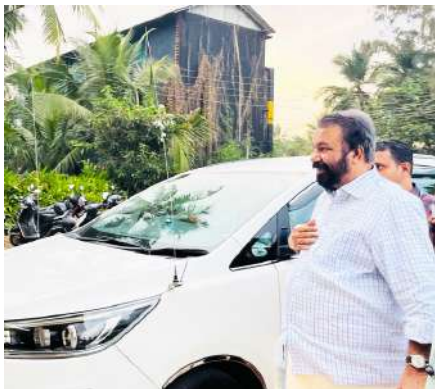
Shri. V. Sivankutty Minister for general education & Labour