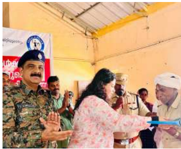
Shri. VU. Kuriakose IPS Idukki district police chief