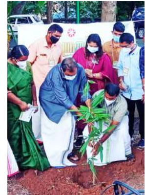
Shri. V. Sivankutty Minister for general education & Labour