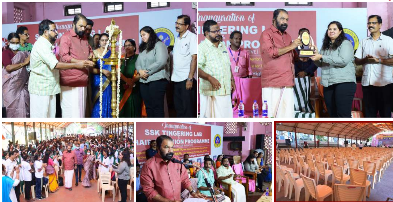
Shri. V. Sivankutty, Minister for general education & Labour