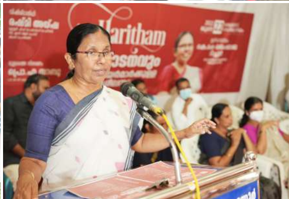
Ms. KK Shailaja, Former Health Minister of Kerala, Currently Member of the Kerala Legislative Assembly (MLA)