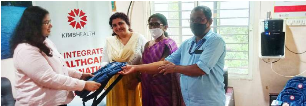
Programme Held at Kerala state aids control society