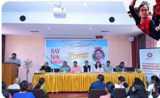
VK Prasanth - Member of Kerala Legislative Assembly