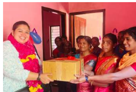
Bio degradable Sanitary Napkins were distributed in all Valayimapura's