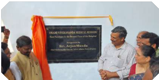
Central minister for Tribal affairs Shri. Arjun Munda & Tamilnadu, Coimbatore, MLA, Smt. Vanathi Srinivasan