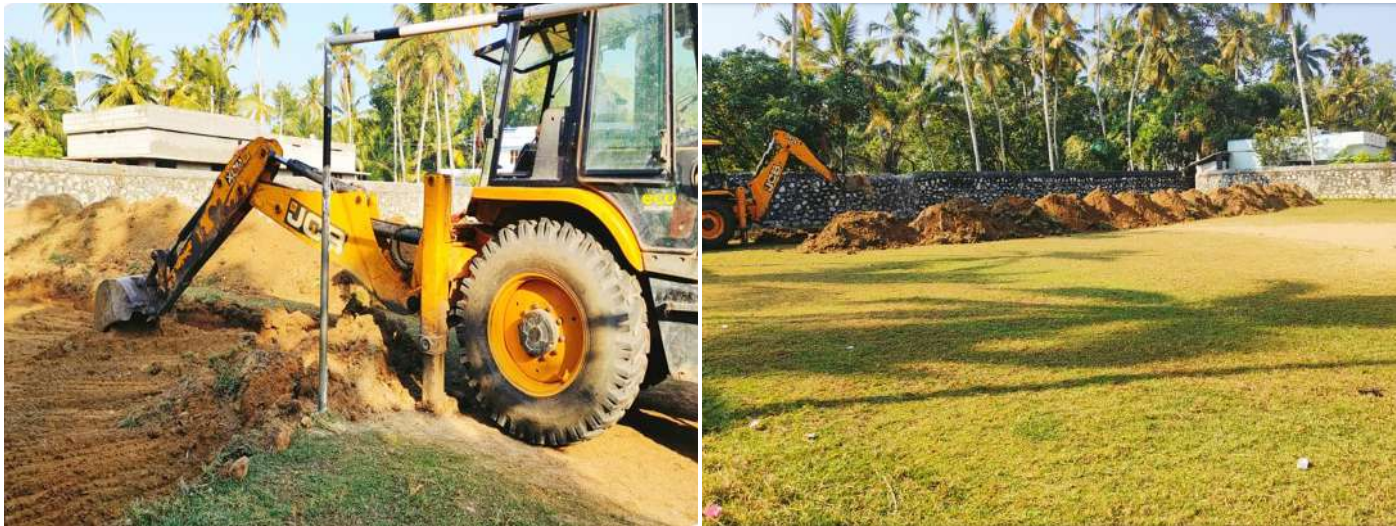
Renovated Welfare football stadium at perumathura