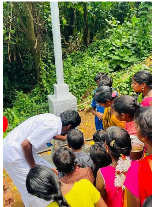
Incinerators were installed in all Valayimapura's