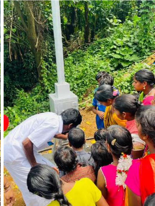
Incinerators were installed in all Valayimapura's