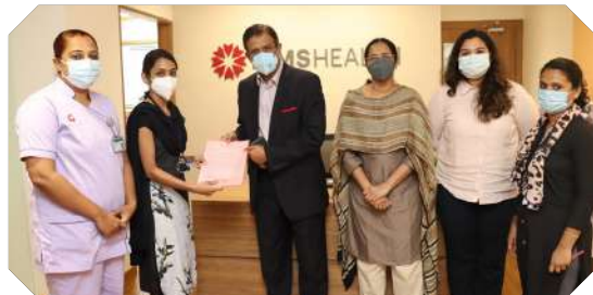
Training to Nurses from SVMM Hospital Attappadi